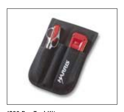
IS20 Pro-Tool Kit

Part Number Description 11024-030 IS30 Pro-Tool Kit