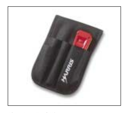
IS10 Pro-Tool Kit

Part Number Description 11024-020 IS20 Pro-Tool Kit