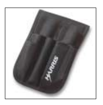
Pro-Tool Kit Pouch

Part Number Description 11024-010 IS10 Pro-Tool Kit