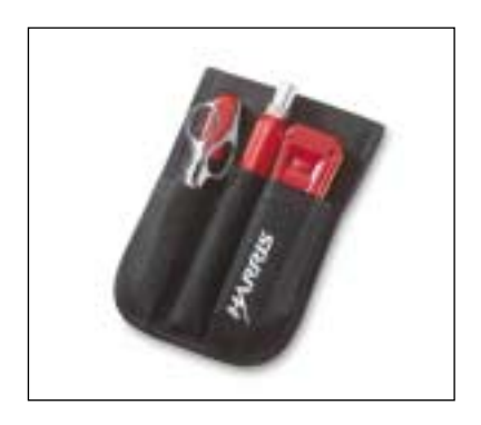
IS30 Pro-Tool Kit